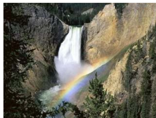
A rainbow shimmers above the Lower Falls of the Yellowstone River at Yellowstone National Park. While the park is visited by 2.5 million annually, and can seem packed, it is a place you should see sometime in your lifetime.

Why Sequoia-Kings? About 200 miles southwest of its more famous High Sierra neighbor, Sequoia-Kings Canyon is akin to Yosemite in scenery and topography. It doesn't boast landmarks as famous as Half Dome or El Capitan, but it does offer more hiking trails (about 800 miles total), higher